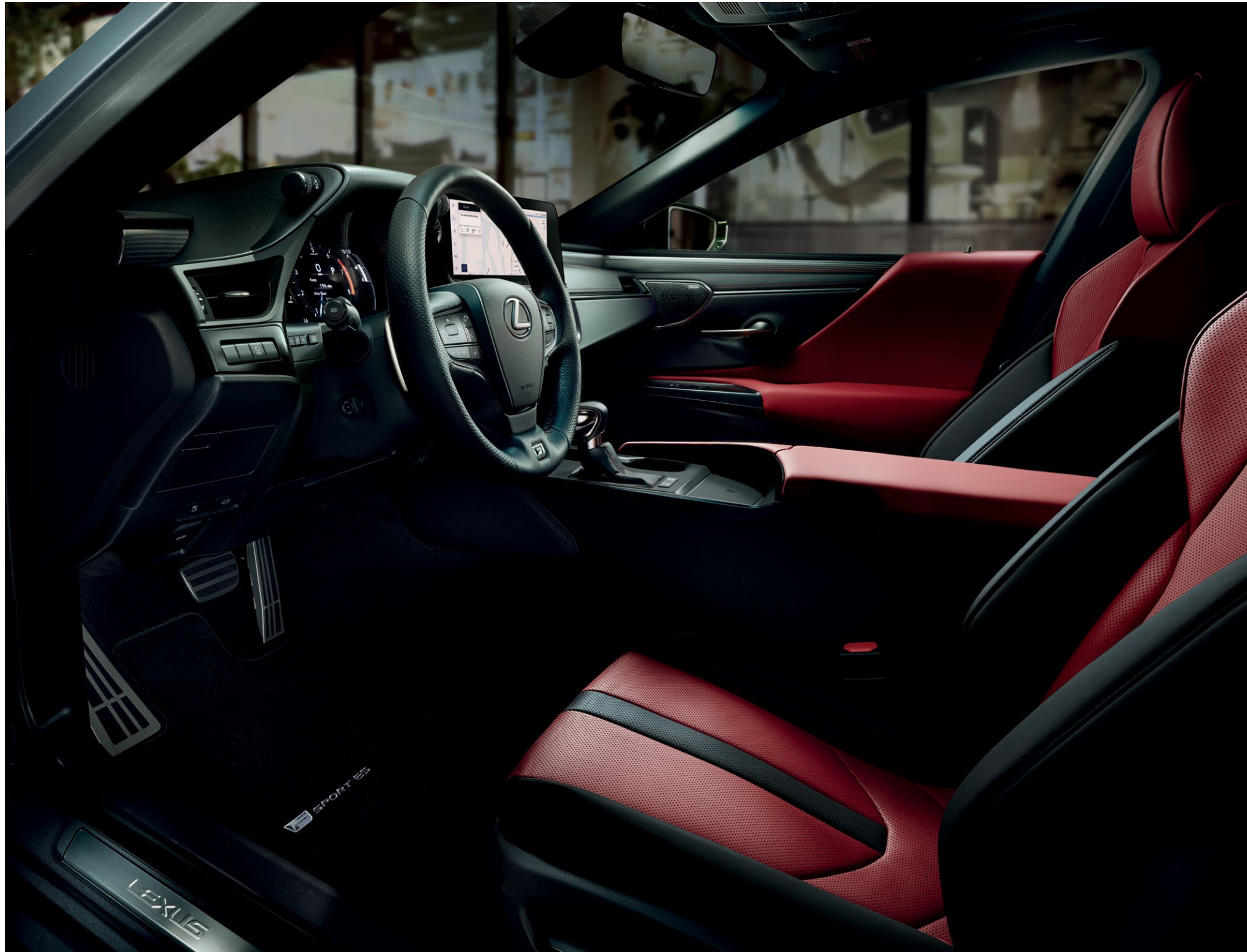
ES F SPORT Handling shown with Circuit Red NuLuxe® and Hadori Aluminum interior trim