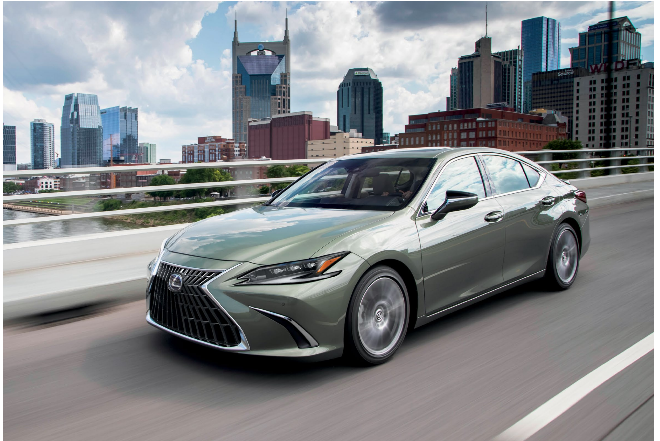
ESh shown in Sunlit Green

Combining next-generation hybrid technology and a highly potent 2.5-liter engine, this is the best of everything the ES has to offer. Its battery is not only remarkably small and lightweight, but also strategically placed as close to the middle of the vehicle as possible for optimized front/rear weight distribution and a lower center of gravity. And with paddle shifters that deliver driving dynamics similar to the ES 250 AWD and ES 350, the ES Hybrid and ES Hybrid F SPORT models bring you closer to the road than ever before. Pairing powerful performance with a 44-MPG combined estimate, 2 it isn't just the most fuel-efficient Lexus sedan ever—it's the most fuel-efficient among all non-plug-in luxury vehicles, 1 period.