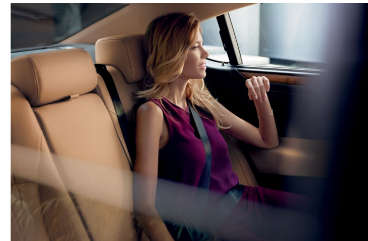
ESh shown with Apple CarPlay 7 integration and Palomino semi-aniline leather interior trim

Featuring Lexus Interface 6 and innovations including wireless Apple CarPlay compatibility and available class-exclusive audio technology, 4 the ES helps keep you more connected than ever before.