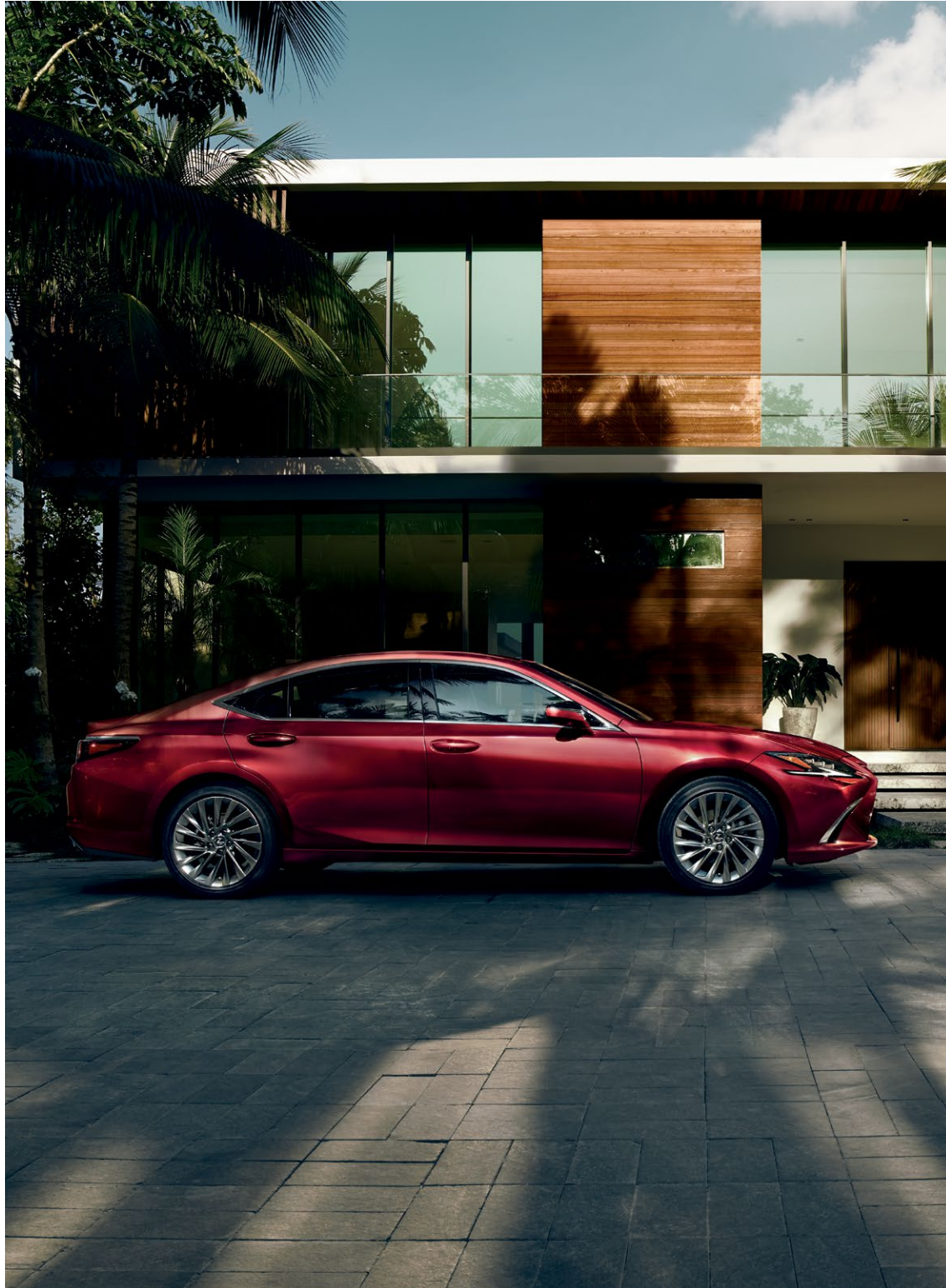
ES shown in Matador Red Mica