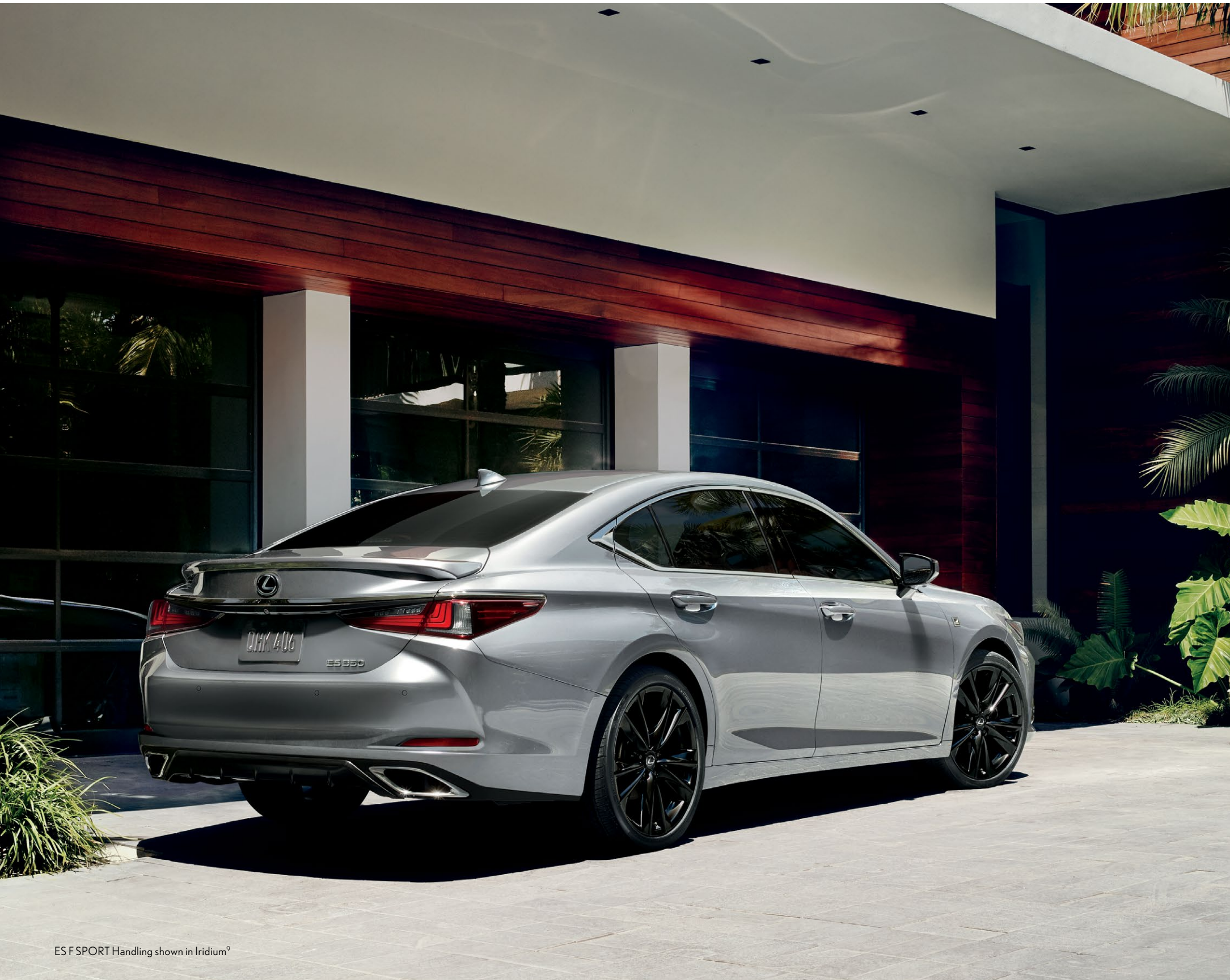
ES F SPORT Handling shown in Iridium 9