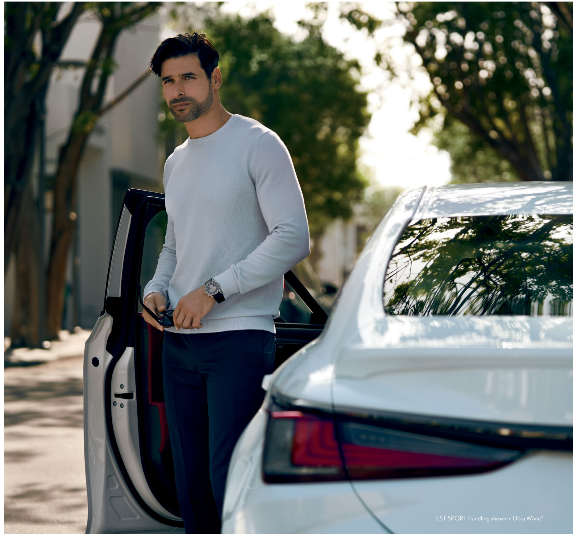
ES F SPORT Handling shown in Ultra White 9