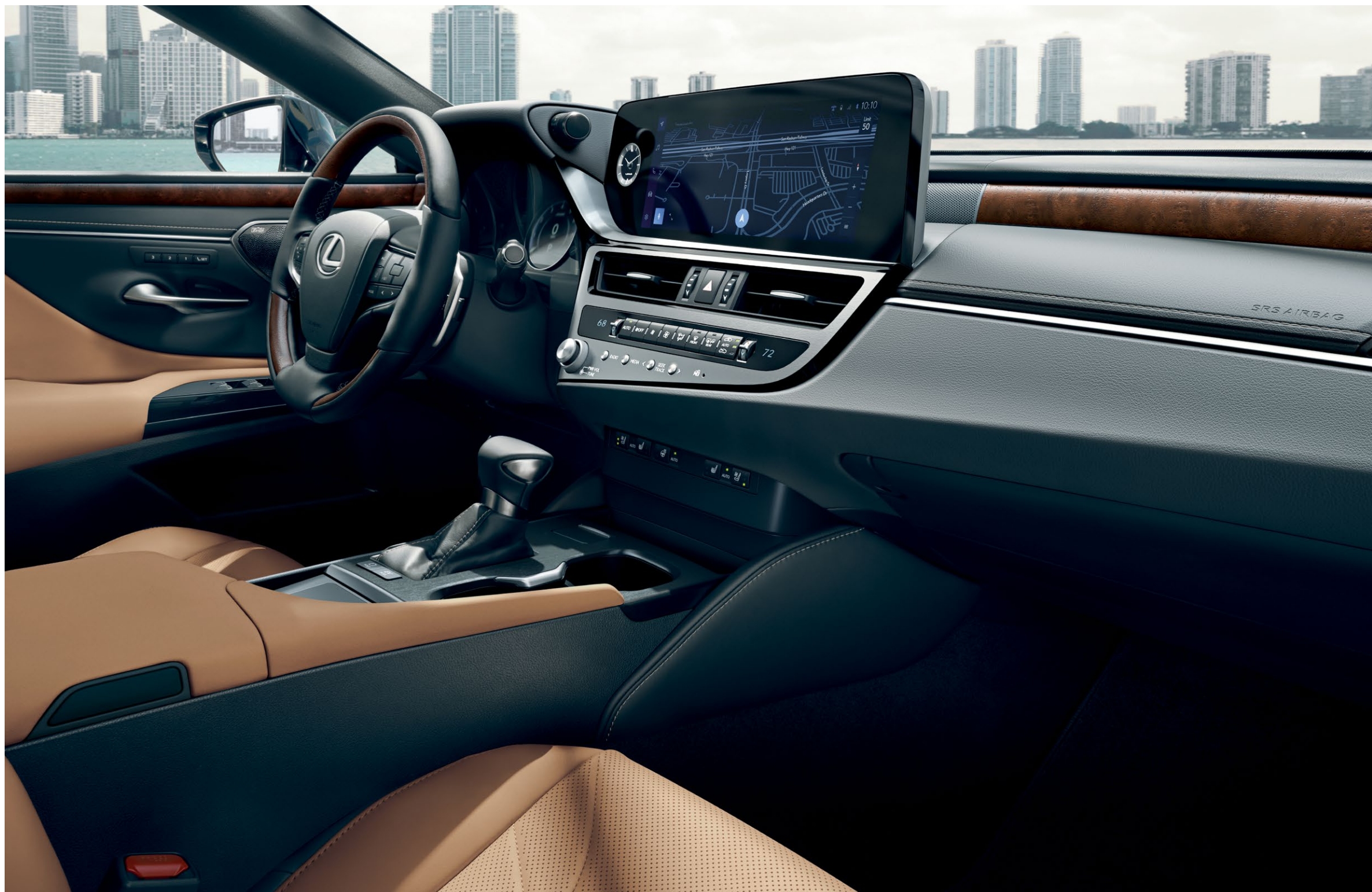
ESh shown with Palomino semi-aniline leather and Open-Pore Brown Walnut interior trim

With contemporary styling and cutting-edge technology, the ES offers a refreshing point of view on modern luxury. Discover thoughtful amenities like 10-way power-adjustable seats with available heating and ventilation, designed to envelop you and connect you to the road. Unlike conventional ventilated seats, these pull air directly from the climate-control system to more effectively and efficiently cool you. These refined luxuries are complemented by numerous expressions of modern style and technology—from an intuitively positioned available 12.3-inch touchscreen display to available ambient lighting that accentuates the sculpted lines throughout the cabin.